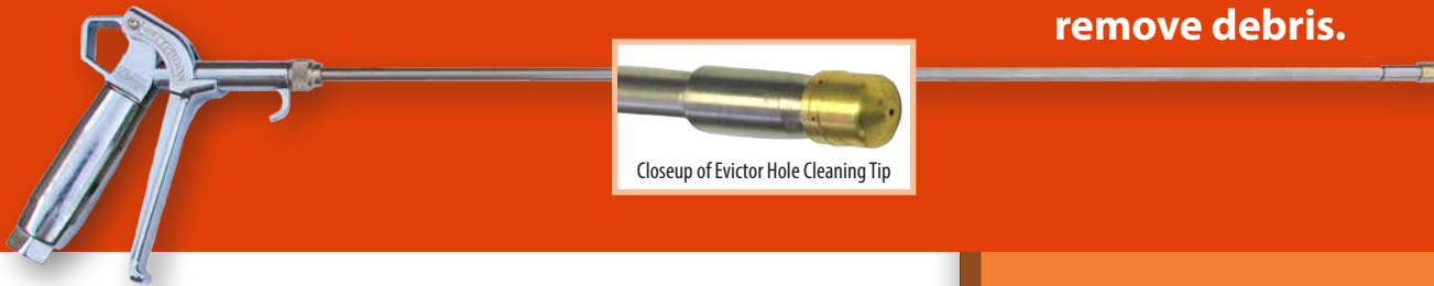
Closeup of Evictor Hole Cleaning Tip

The Typhoon Evictor™ is specifically designed to clean drilled holes.