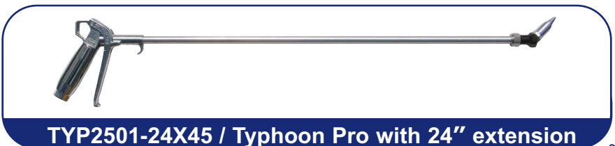
TYP2501-24X45 / Typhoon Pro with 24" extension