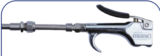
Compression fitting holds angle

Tough, zinc die cast body. Nickel plated for superior corrosion protection and attractive appearance.