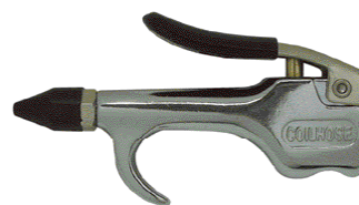
Rubber Tip 601