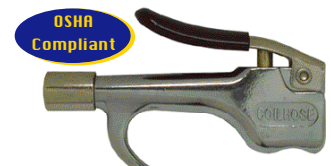
Tamper Proof 600-ST-DL