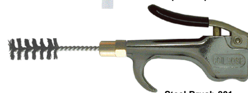
Steel Brush 801