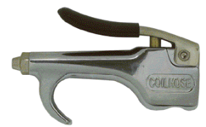
Brass Tip 605