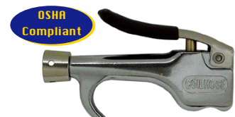
Safety Shield 600-SS