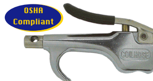
Safety (Standard) 600S-DL