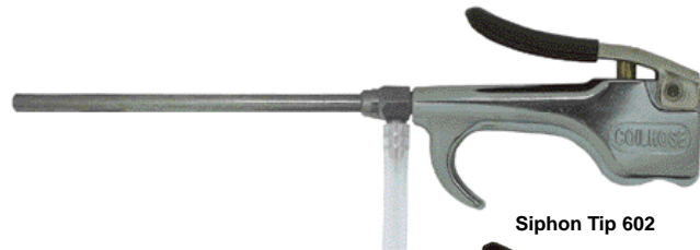
Siphon Tip 602