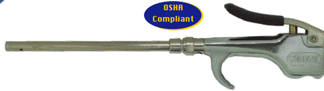
Safety Extension Tip 606-S