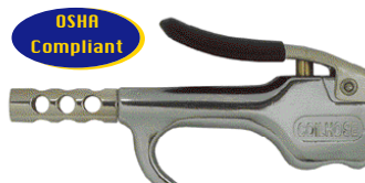
Safety Booster 600-SB